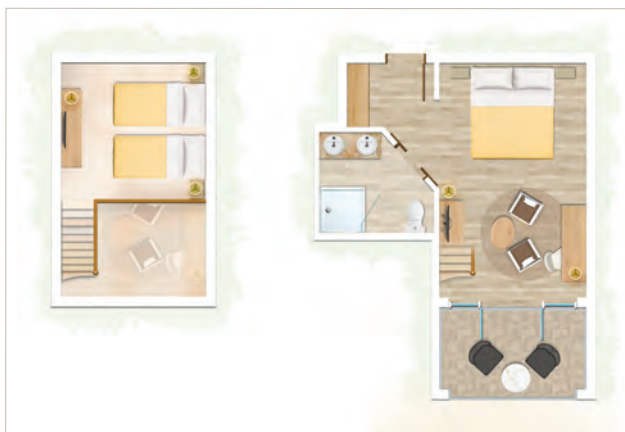
Family Duplex Garden / Family Duplex Sea facing