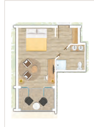
Standard Sea facing