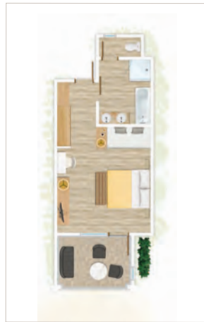
Deluxe Sea Facing Room