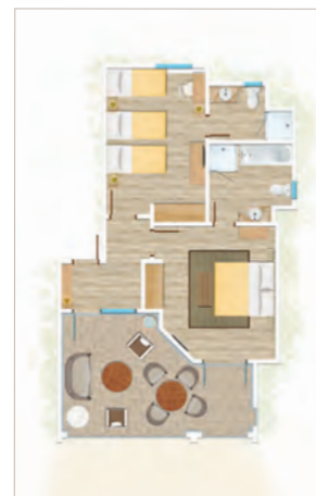
2-Bedroom Family Apartment