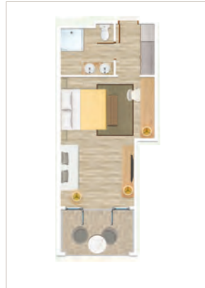
Superior Garden / Superior Sea facing